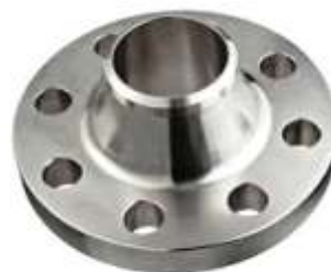
Weld Neck Flange