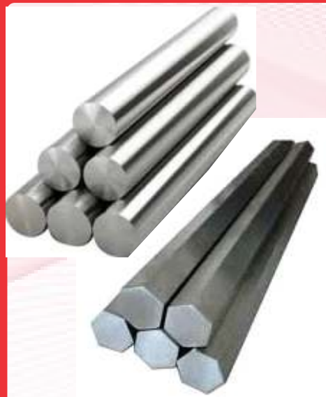
BAR (ROUND & HEX )