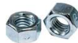
TWO WAY LOCK NUT