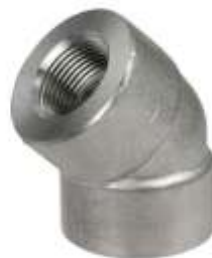
THREADED 45° ELBOW