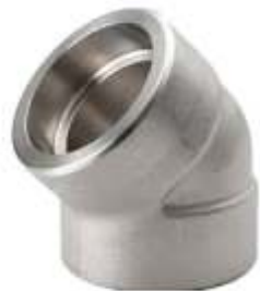
Socketwelded 45° elbow