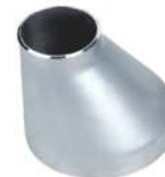
BW Eccentric Reducer