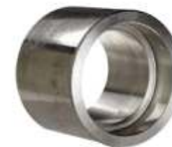
Socketwelded Half Coupling