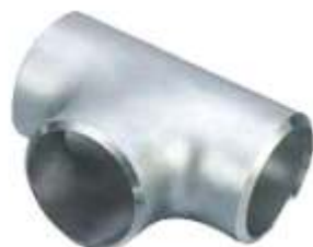
BW Equal Tee