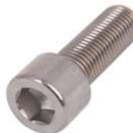
SOCKET HEAD BOLT