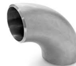
BW 90° SR Elbow