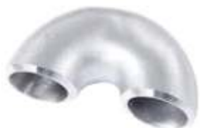
BW 180° SR Return