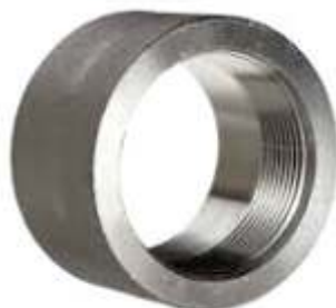
Threaded Half Coupling