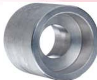
Socketwelded Reducing Coupling