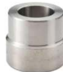
Socketwelded Reducing Insert Type -1