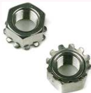
K LOCK NUT