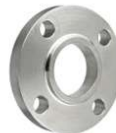
Lap Joint Flange