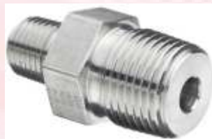
Threaded Reducing Hex Nipple