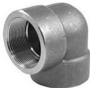
THREADED 90° ELBOW