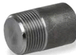
Threaded Round Head Plug