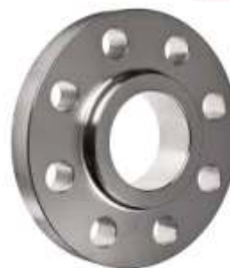
Slip On Flange