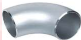
BW 90° LR Elbow