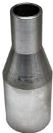
Concentric Swage Nipple