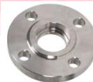
Socket Weld Flange