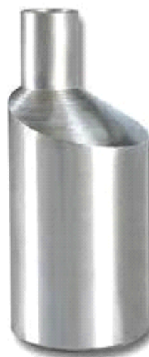
Eccentric Swage Nipple