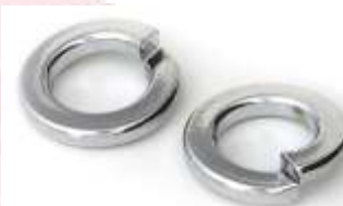
SPRING LOCK WASHER