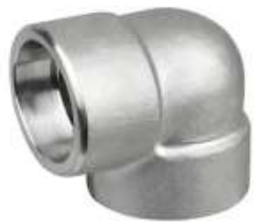
Socket welded 90° elbow