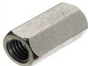
HEX COUPLING NUT