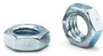
HEX JAM NUT