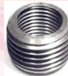
Threaded Flush Bushing