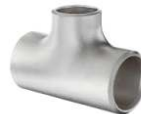
BW Reducing Tee