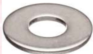
PLAIN FLAT WASHER