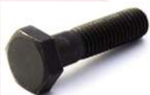
HEAVY HEX BOLT