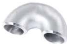
BW 180° LR Return