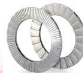
WELD LOCK WASHER