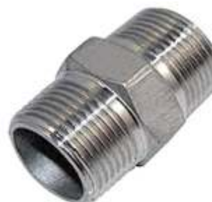
THREADED HEXAGONAL NIPPLE