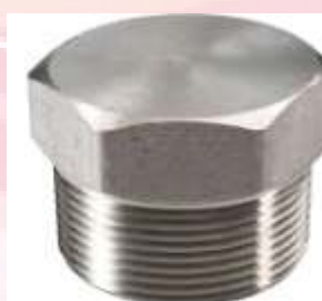
THREADED HEX HEAD PLUG