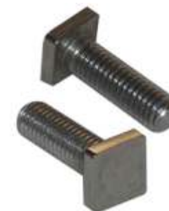
SQUARE HEAD BOLT