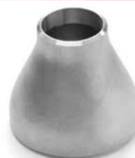
BW Concentric Reducer