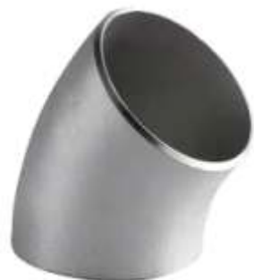
BW 45° Elbow