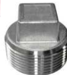
Threaded Square Head Plug