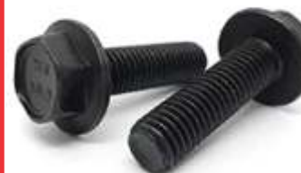
HEX FLANGE BOLT