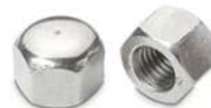
HEX CAP NUT