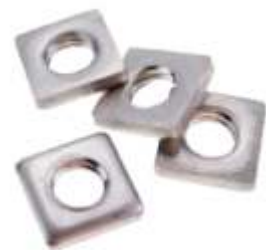
SQUARE THIN NUT