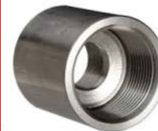
Threaded Reducing Coupling