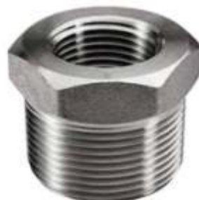
Threaded Hex Head Bushing